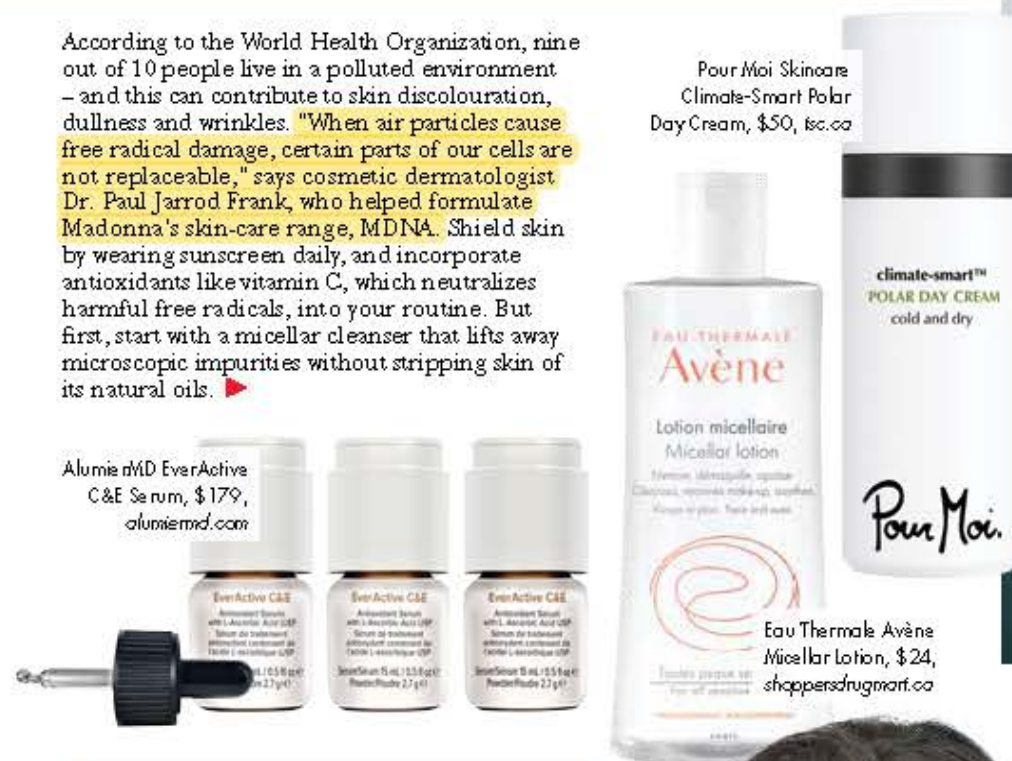
Alumie nMD EverActive C&E Serum, $179, alumienmd.com