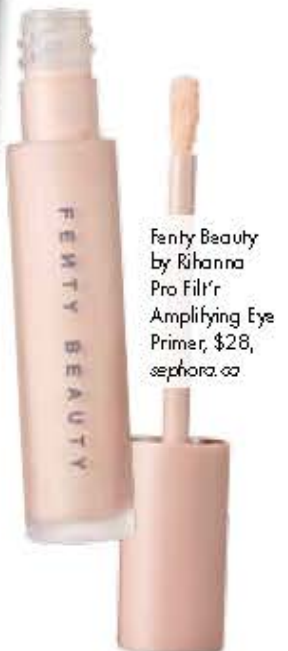
Fenty Beauty by Rihanna Pro Fill'r Amplifying Eye Primer, $28, sephora.ca