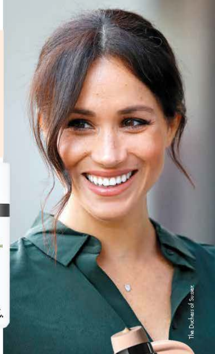
The Duchess of Sussex