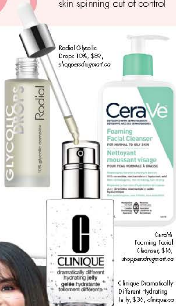
Rodial Glycolic Drops 10%, $89, shoppersdrugmart.ca

A bit of breakout is normal, but many women break out because they're using the wrong products for their skin such as creams that contain oil, says Dr. Rhonda Rand, long-time dermatologist to Angelina Jolie. The solution: edit down your skin-care routine to the essentials and avoid your mother's too-rich anti-aging cream. "Moisturizer doesn't prevent wrinkles, it treats dryness," she explains, adding that you can apply oil-free lotions to parched areas if you have combination skin. Otherwise, stick to a multi-tasking SPF to protect against aging UV rays. Glycolic acid is effective at sloughing away dead skin cells to aid with acne, and can also be applied selectively to areas that need it.