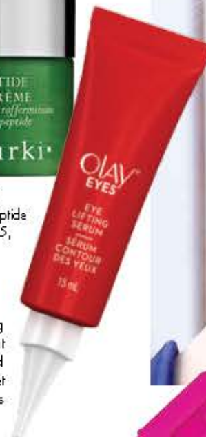
Olay Eyes Lifting Serum, $34, at drugstores and mass-market retailers