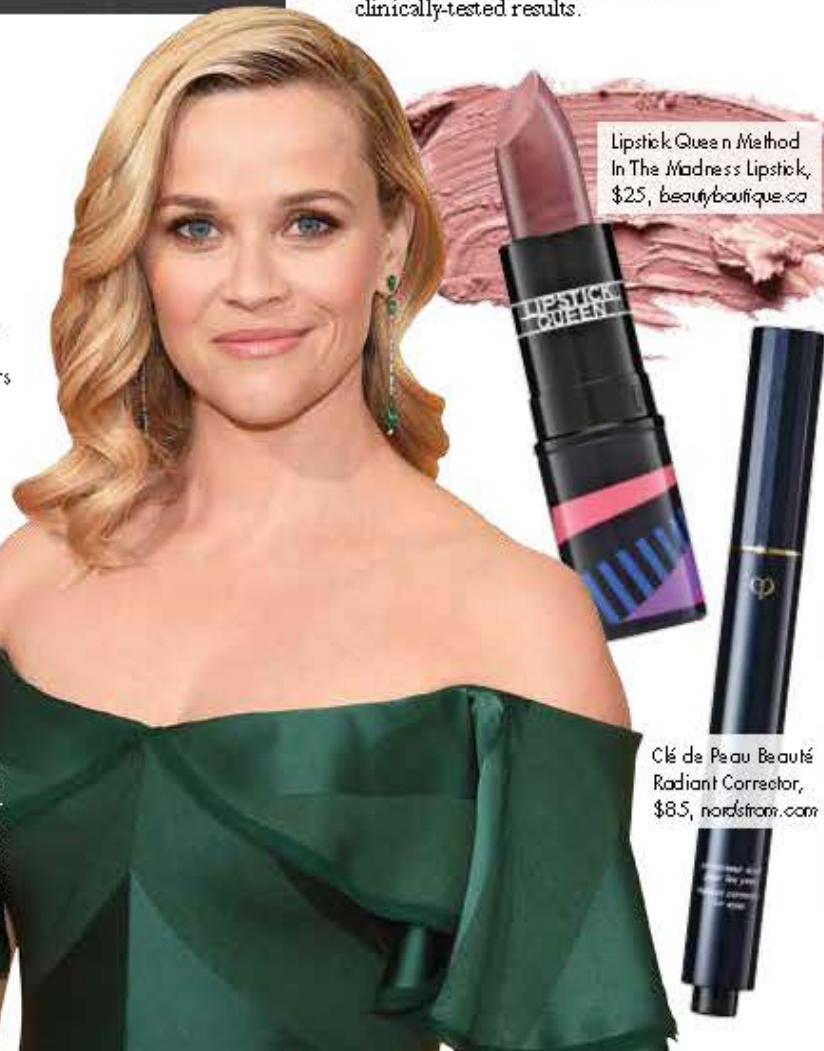
Lipstick Queen Method In The Madness Lipstick, $25, beautyboutique.ca