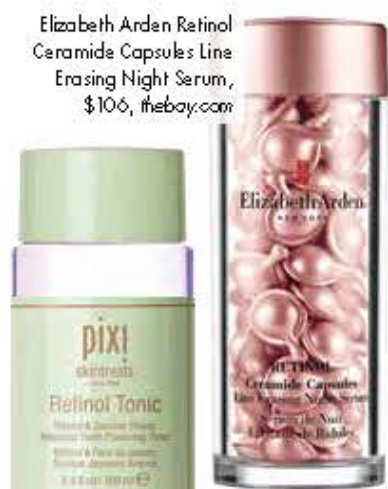
Elizabeth Arden Retinol Ceramide Capsules Erasing Night Serum, $106, thebay.com