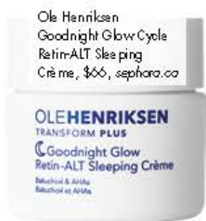
Ole Henriksen Goodnight Glow Cycle Retin-ALT Sleeping Crème, $66, sephora.ca