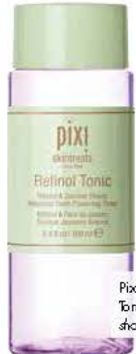
Pixi Beauty Retinol Tonic, $20, shoppersdrugmart.ca