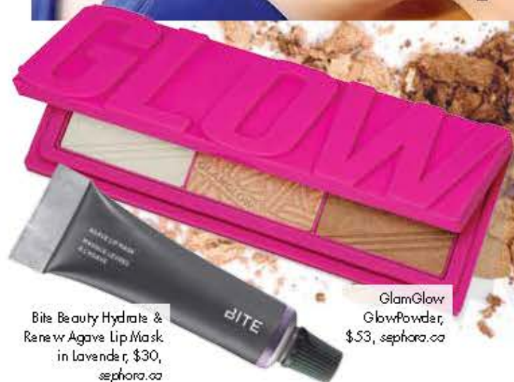
Bite Beauty Hydrate & Renew Agave Lip Mask in lavender, $30, sephora.ca

Oils like jojoba and sweet almond add an extra layer of comfort to a dehydrated pout. Plus, soft-focus foundations and highlighters enriched with hyaluronic acid ensure your makeup never looks cakey.