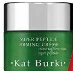
Kat Burki Advanced Anti-Aging Super Peptide Firming Crème, $285, beautyboutique.ca