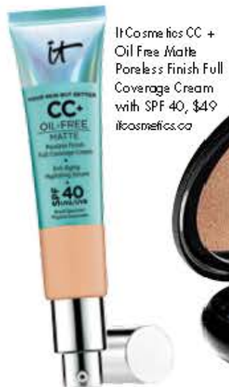
It Cosmetics CC+ Oil-Free Matte Poreless Finish Full Coverage Cream with SPF 40, $49, itcosmetics.ca

An oil-free, tinted CC cream with high SPF provides UV protection without having to layer skin care, which can lead to clogged pores. Eyeshadow primers and gel-formula colours ensure eyeshadows stay put over greasy eyelids.