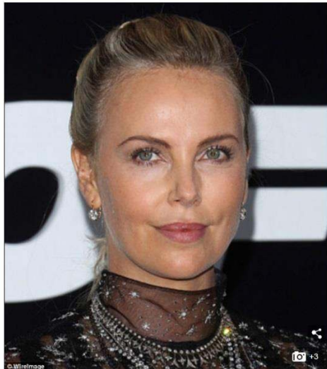
The perfect pout? One plastic surgeon told FEMAIL that actress Charlize Theron, 41, inspires his older clients (ages 40 and up), who prefer a natural and smooth look